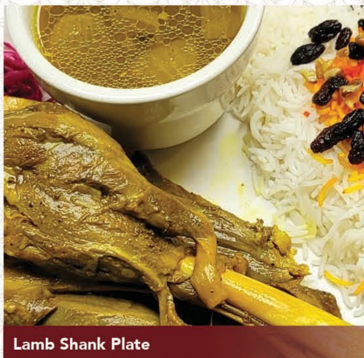
Lamb Shank Plate