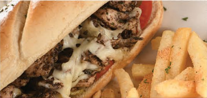
Mediterranean Chicken Sandwich