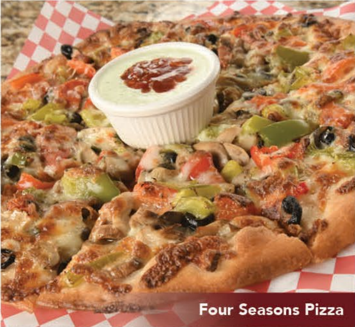
Four Seasons Pizza