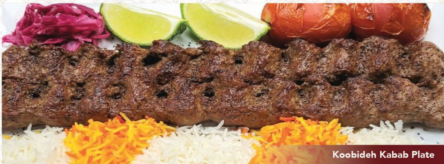
Koobideh Kabab Plate